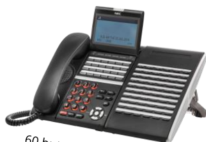
60 button console add-on

Note: Add-on modules are only available on select handset models. Not all modules are immediately available for sale