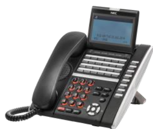
8 button add-on

Sometimes 24 buttons are just not enough - NEC has both an 8 and 60 button add-on module to ensure the features you need are simply a button press away.